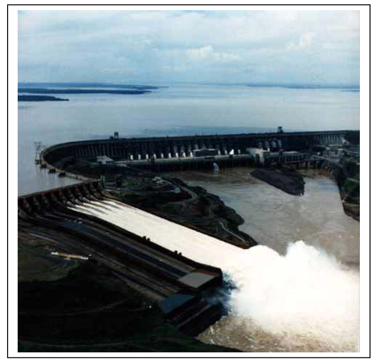
Although Leonardo da Vinci was not the first to advocate the experimental method, he differed considerably from others in the degree to which he exemplified what he advocated. His basic premise was "remember when discoursing on the flow of water to adduce first experience and then reason".

The jump of Bidone in Italy is no other than what we today call the "hydraulic jump"; a phenomenon that Bidone had described with the following words: "If, when a stream has been established in a rectangular channel... the flow of water is totally impeded by lowering a gate in any section of the channel itself, the waters thus restrained rise immediately up to a certain height against the gate and form an intumescence." It is precisely this more or less abrupt "jump" that we understand to be the "hydraulic jump" (figure 1).