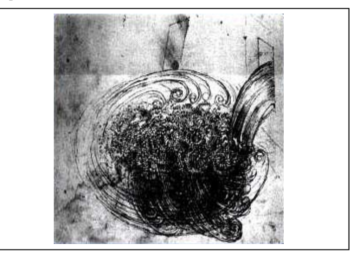
Fig. 2. A free water jet issuing from a square hole into a pool (by Leonardo da Vinci, Catalogue of the Windsor Royal Library).

Typical of the phenomena that he was the first to sketch or describe are the velocity distribution in a vortex, the formation of eddies at abrupt expansions (figure 2), and the hydraulic jump.